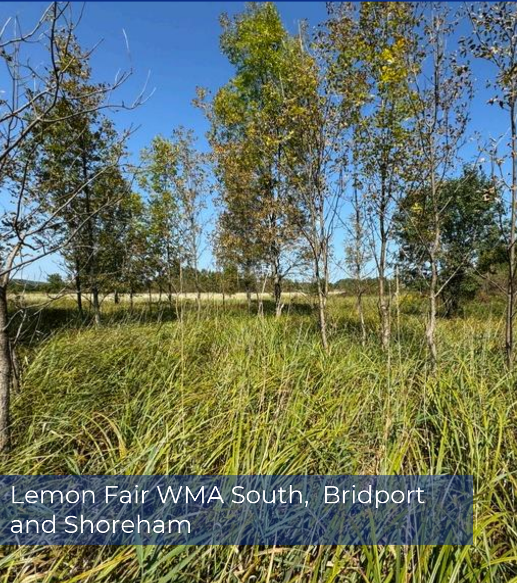
Lemon Fair WMA South, Bridport and Shoreham