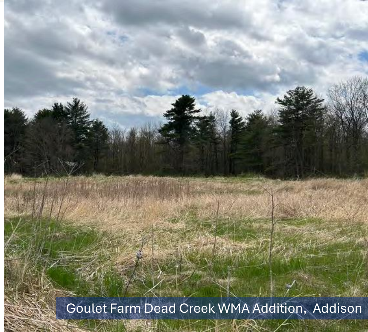
Goulet Farm Dead Creek WMA Addition, Addison

Collaboration is essential: In this environment, coordinated efforts, shared tools, and creative partnerships across organizations and scales are critical to achieving meaningful and measurable progress.