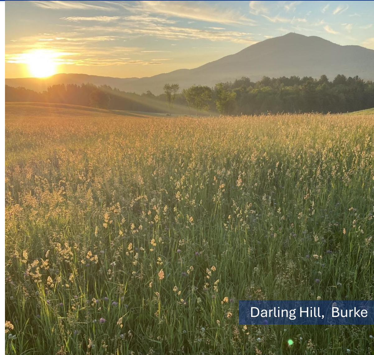
Darling Hill, Burke