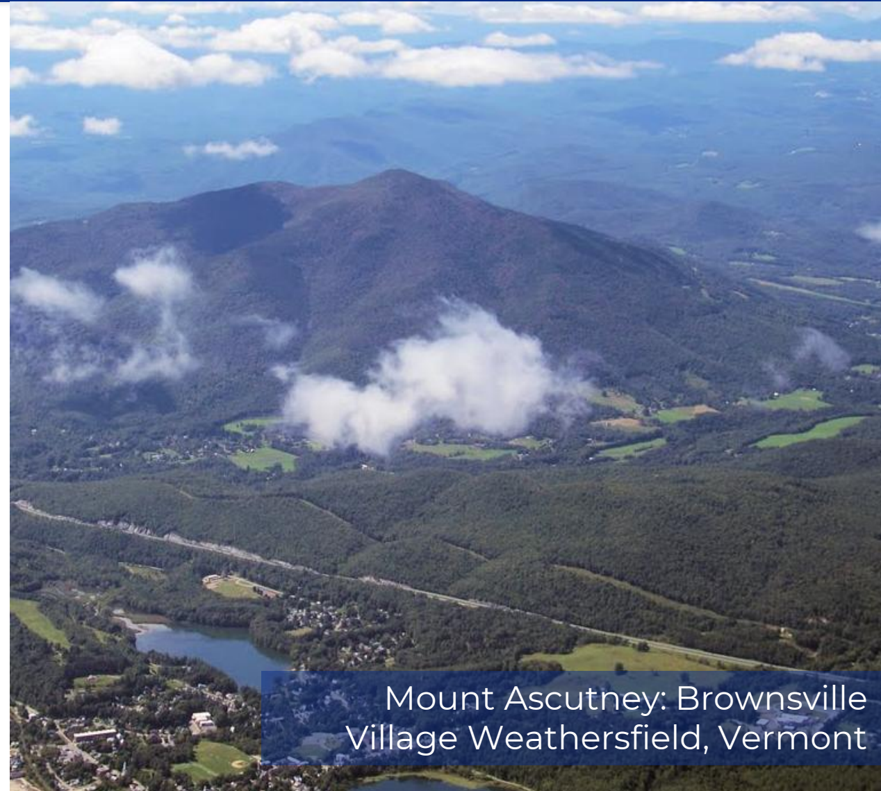
Mount Ascutney: Brownsville Village Weathersfield, Vermont