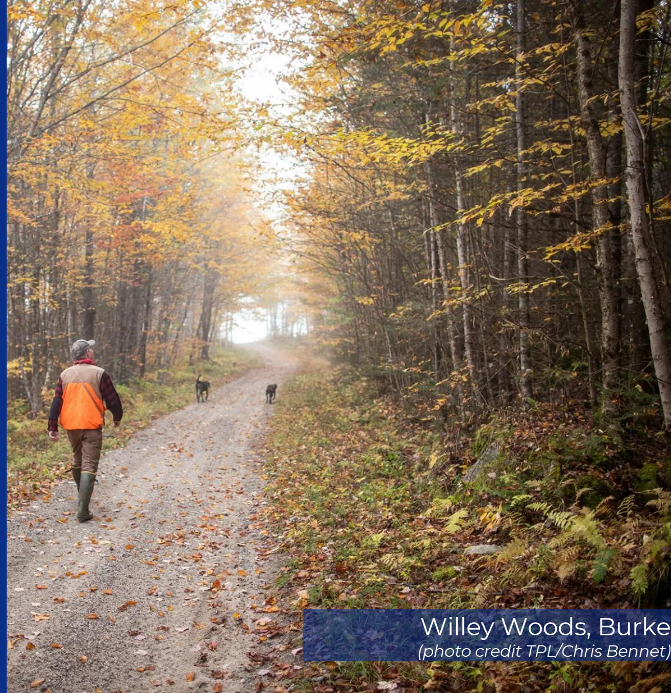
Willey Woods, Burke