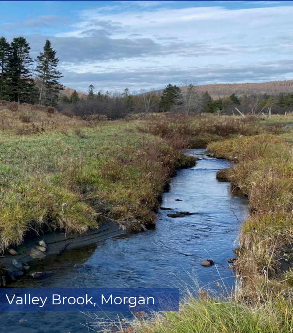
Valley Brook, Morgan

10 V.S.A. Section 2804(b) directs VHCB in consultation with ANR to Provide a Comprehensive Strategy for Achieving the Vision and Goals of the Act