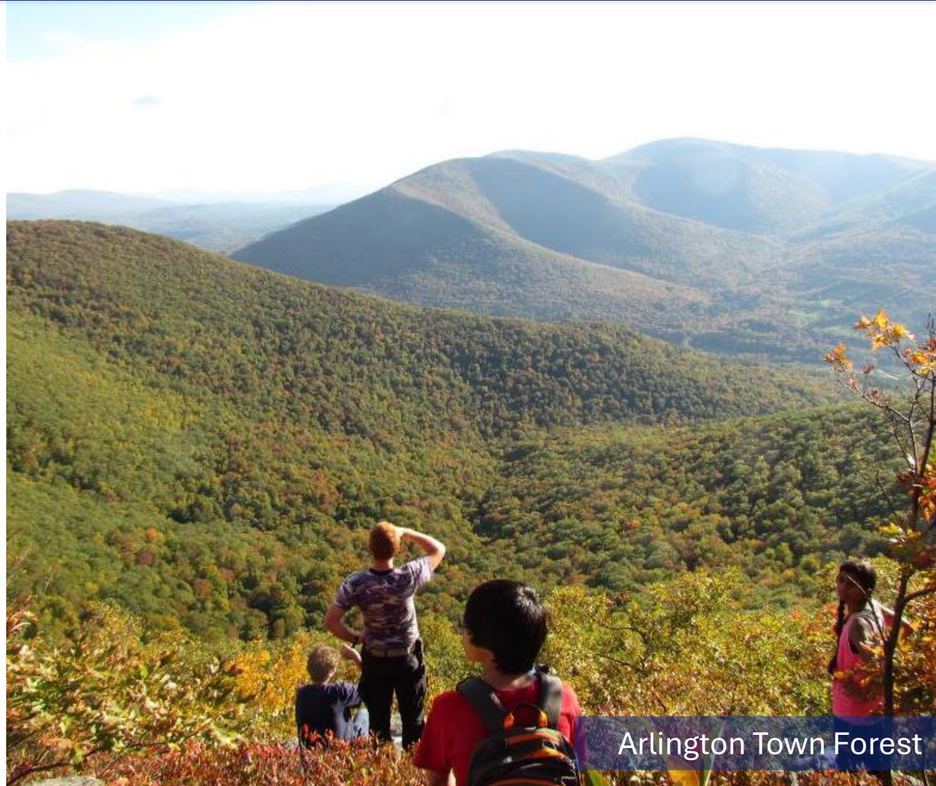
Arlington Town Forest