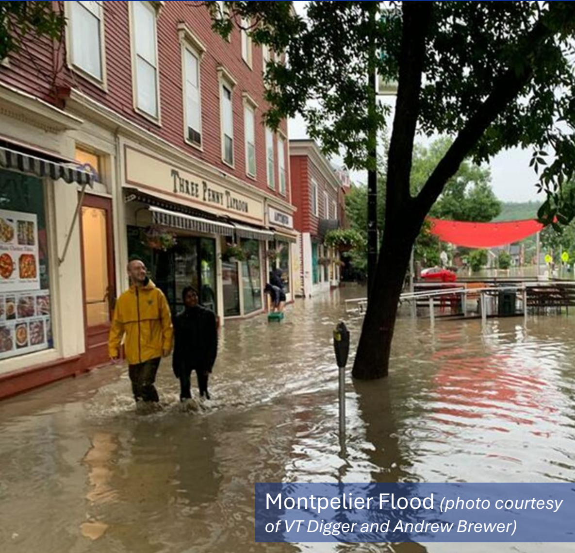
Montpelier Flood