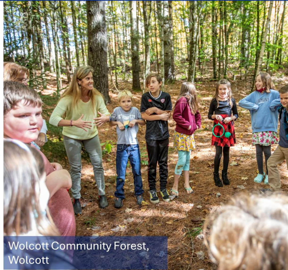
Wolcott Community Forest, Wolcott

Goals: Conserve 30% of Vermont by 2030 and 50% by 2050 .