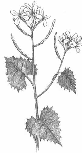
Illustration by Anne Hunter

Add Parmesan cheese, blend with sauce using pulse feature briefly.